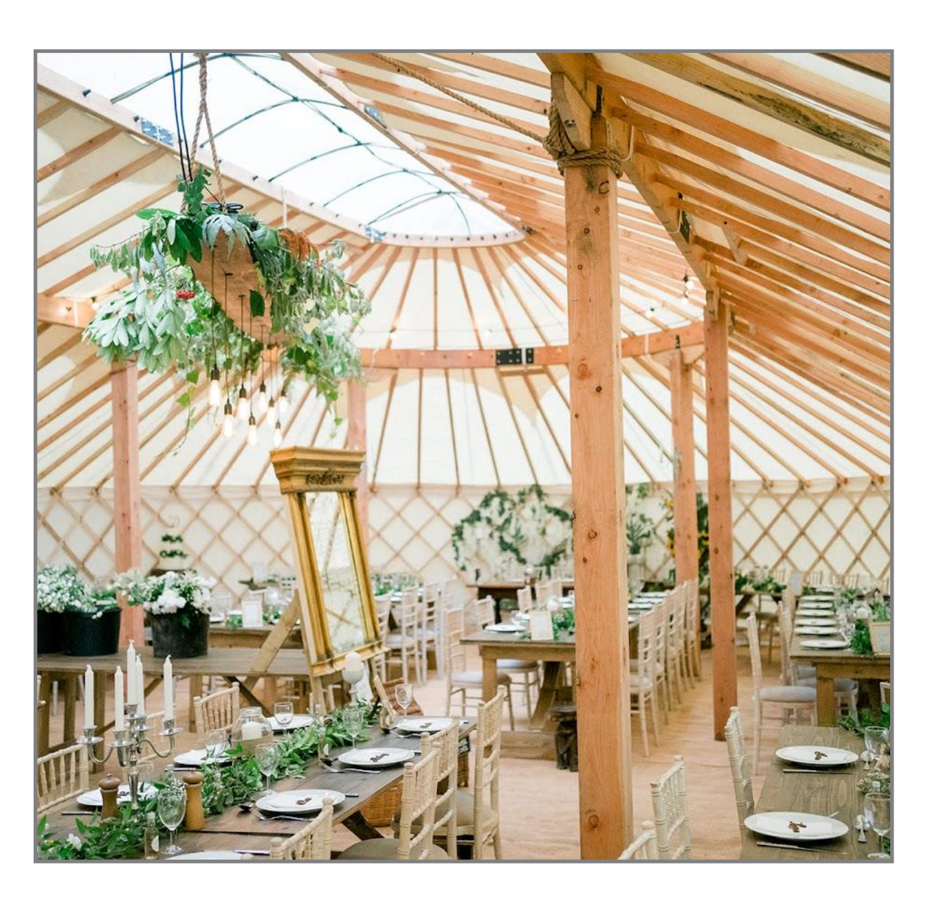
A unique venue for your special day